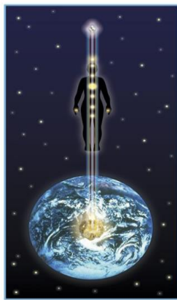
CONNECTED AS ONE